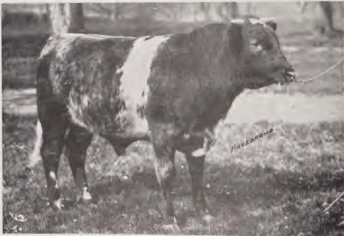
DIAMOND SULTAN 379692.